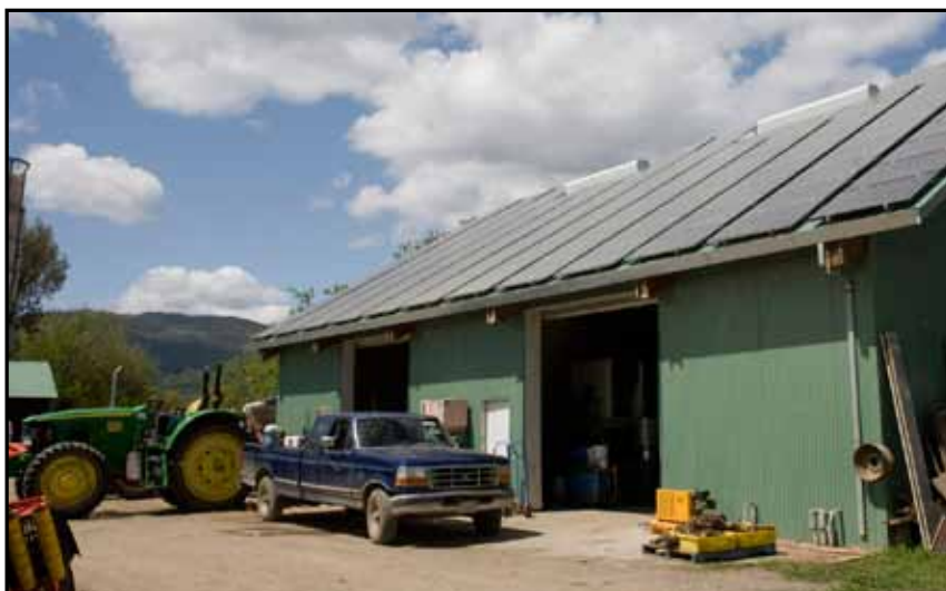
Dozens of solar panels capture energy to help power Full Belly Farm in Guinda. The panels, which sit atop one of the Farm's repair shops, produce 23 kilowatts of energy to power the Farm's packing shed.